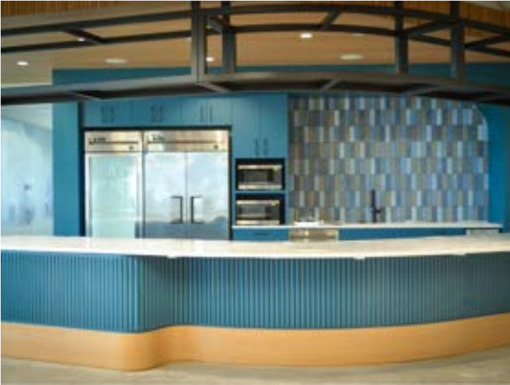
Columbia, MD Common Areas, Marble/Quartz