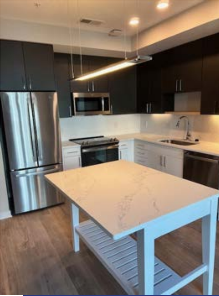
Alexandria, VA, 1024 Units, MDF Frameless, Quartz