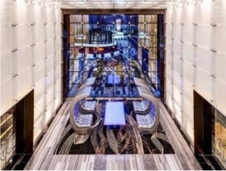
Washington DC, Common Areas, Granite & Porcelain