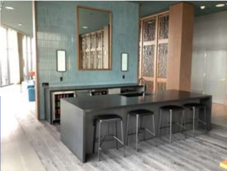
Baltimore, MD , Common Areas, Reception Desk, Granite